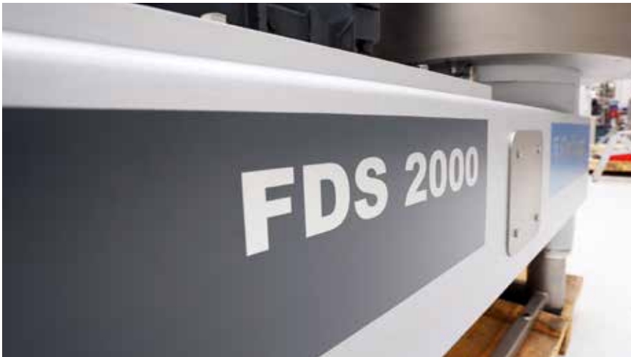
The bowl is the heart of the new Flottweg nozzle separator.

imum clarification or separation combined with high solids content is required in the starch industry. Flottweg's nozzle separators are primarily used here. The Flottweg nozzle separator's spectrum of use covers various starch applications. In addition to the production of wheat and potato starch, the nozzle separator can also be used in the corn or tapioca starch production process.