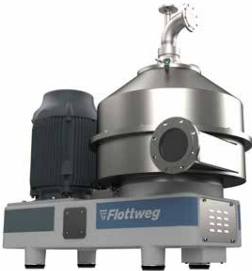
The nozzle separator is the newest member of the Flottweg family and is particularly suitable for use in the food industry.

tenance. „For us, this means not only optimal maintenance but also the general avoidance of parts requiring maintenance or are subject to wear“, explains Matthias Gaube. „Thus, our contactless sealing system allowed us to significantly reduce potential wear already in the design stage.“ But even maintenance work that must still be undertaken has been optimized to the greatest possible degree thanks to the innovative and low-wear design of the separator bowl. The arrangement of the nozzles creates a natural wear protection of solid material in the bowl. The nozzles of the Flottweg Nozzle Separator are equipped with carbide wear protection for maximum service life. These nozzles can be replaced quickly and easily via a maintenance opening in the housing. The compact spindle drive also deserves special mention: Thanks to the clever design of the nozzle separator, the spindle can be released and replaced quickly by removing just four screws, if necessary.