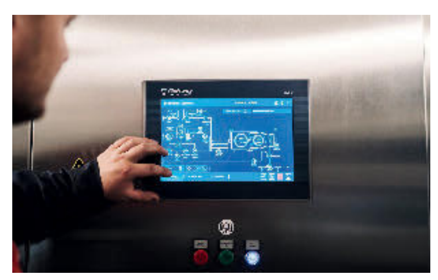
▶ Motice facilitates the digital diagnosis of bearing deterioration in decanters

work-capable Motice stores the characteristic value trends with intelligent data compression for up to ten years. The high level security of user data is guaranteed, because Flottweg only has passive access rights with a release clause relating to the data to be analysed. This means that the Condition