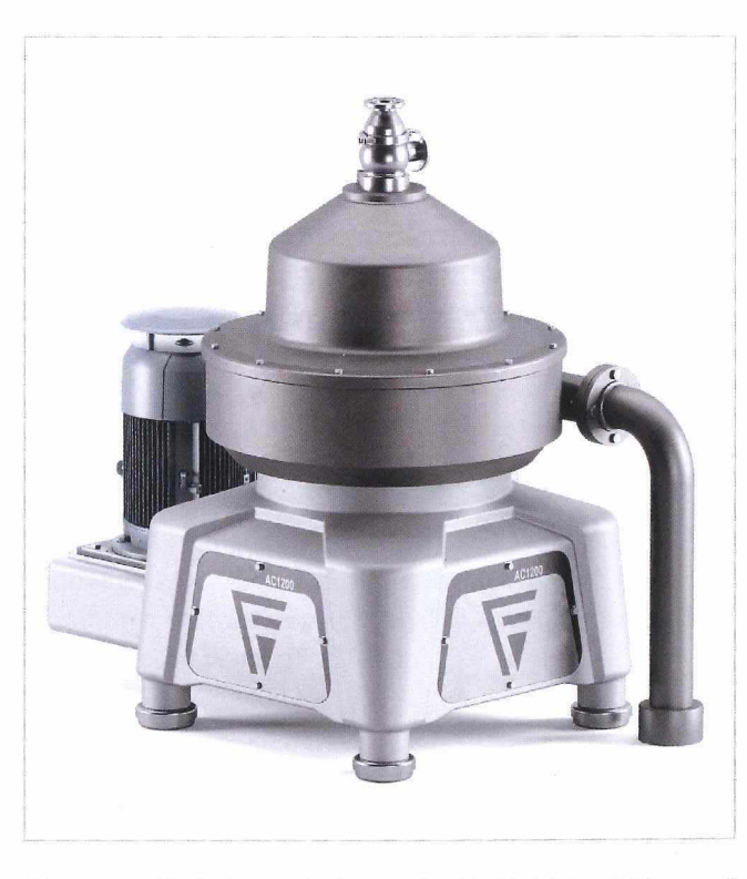
AC1200 410: The belt press is characterized by high juice yields as well as a high dry substance in the pomace.

The trend towards regional production continues to grow virtually uninterrupted. The main focus here is to prevent carbon emissions. Another trend that is emerging in the market is the increased health consciousness of consumers. Here, the focus is mostly on reducing sugar and calories. There is also growth in beverages with added benefits, such as ginger or turmeric, for example.