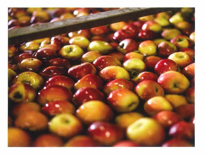
Since the raw materials spoil easily and consumers have high standards, the processing of fruit juices, especially exotic ones, is very challenging when it comes to hygiene-related issues.