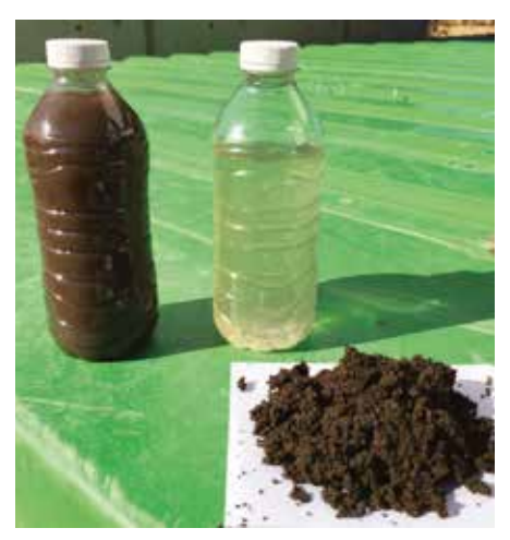
Left: Sludge before dewatering/Right: Centrate after the centrifuge and the discharged solids

Extensive testing on multiple sewage treatment plants clearly show: The Xelletor system wins on all definitive requirements, such as dewatering performance, polymer consumption, and energy consumption, significantly topping the old limits. Then there are additional advantages of centrifuge technology, such the low operating overhead and low noise levels typical of centrifuges. An examination of cost-effectiveness also pays off. The new Xelletor system permits enormous savings.